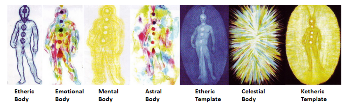
Note: Table by Guy Needler; Figure from Barbara Brennan's "Hands of Light"